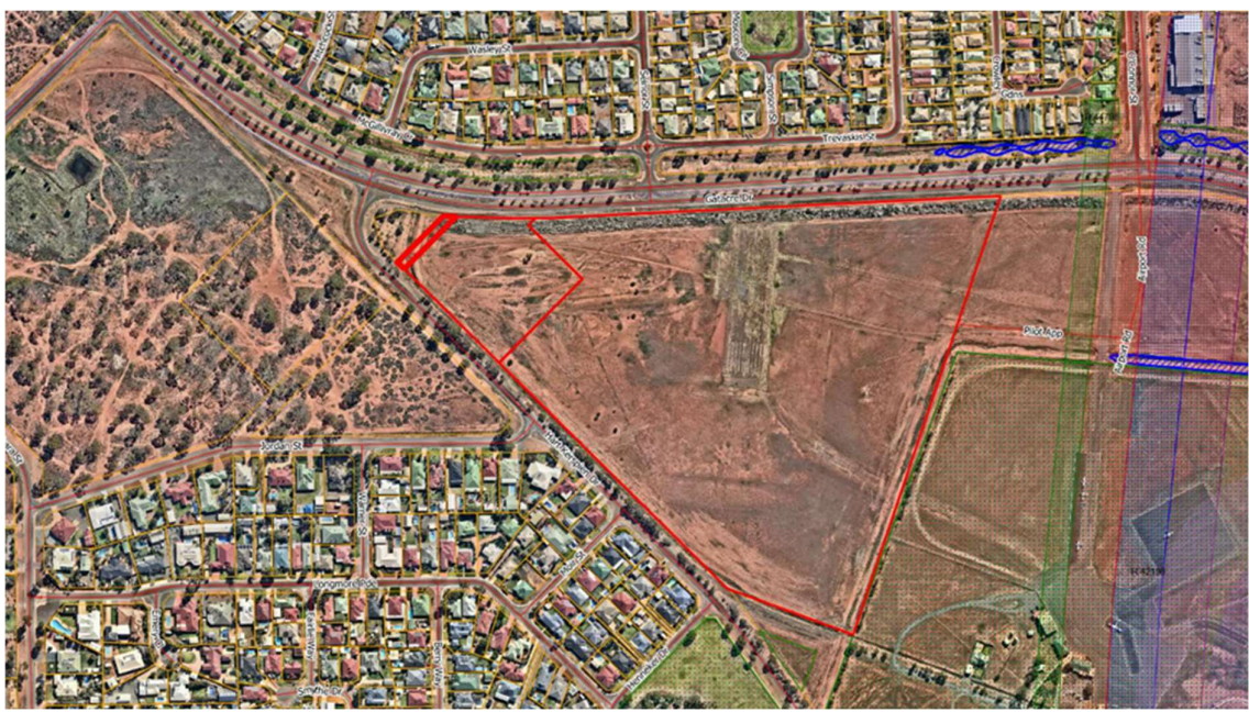
Figure 1 - Lots 9003, 9004 & 9005