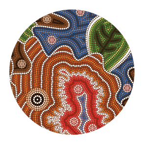
2,244 (7.7%) Of the population identify as Aboriginal and/or Torres Strait Islander people