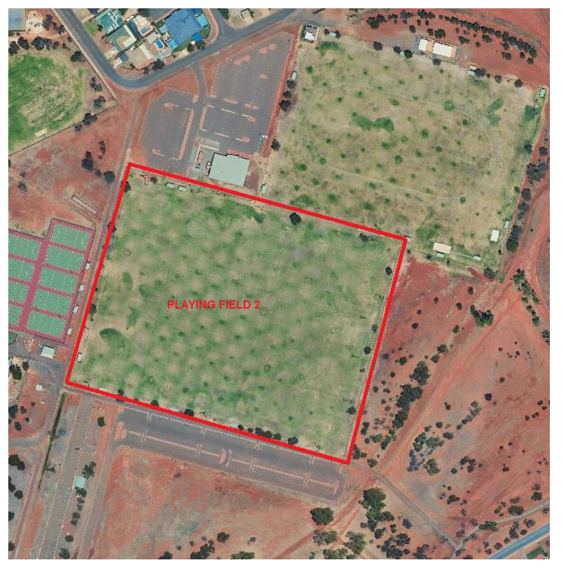
FIGURE 1 – Oasis Playing Field 2

The Associations requested that the playing field lighting would need to be brought to a suitable standard for the 2023/24 season. The initial remediation of the lighting on Oasis Playing Field 2 ( refer to figure 1 below ) was completed in time for the season, with further investment in the Oasis Playing Fields lighting forecast in the Long-Term Financial Plan after the completion of a lighting audit and analysis.