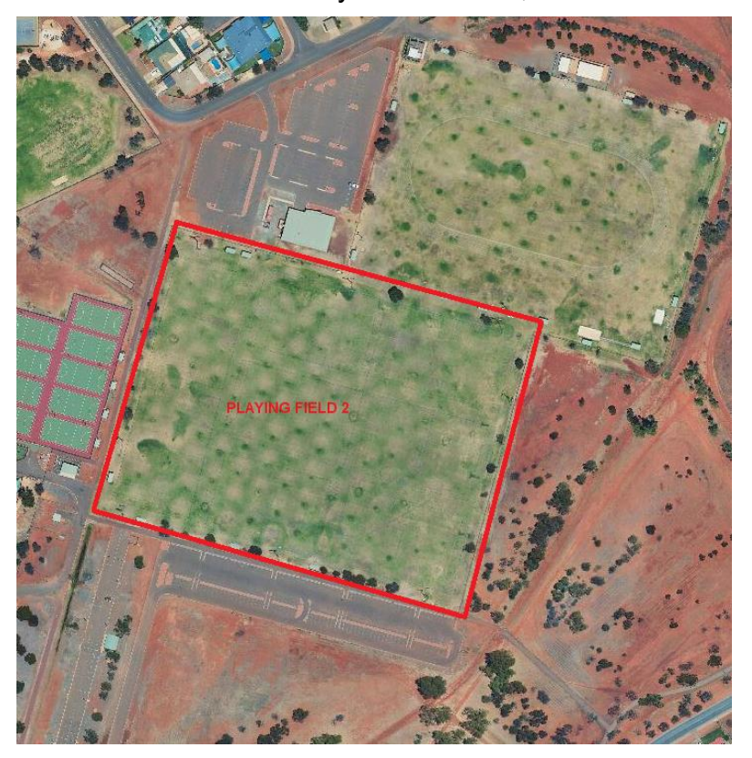
FIGURE 1 – Oasis Playing Field 2

Pending Council endorsement, City Officers have undertaken to repair the Oasis Clubrooms to ensure they are in a safe, secure and usable condition.